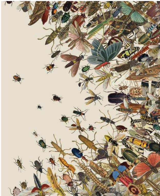
illustrations by Matt Dorfman